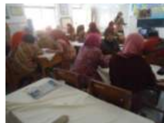
Figure 1. The implementation of PMRI training on MBS Forum

Figure 1 below illustrated the implementation PMRI training on MBS Forum teachers asked to think about PMRI model, PMRI definition, PMRI developmental history, and characteristics of PMRI.