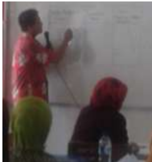
Figure 3. Teaching simulation by elementary school teacher using PMRI model

And the last step teachers is teaching simulation. Figure 3 below illustrated elementary school teacher simulate mathematics learning process by using PMRI model and local genius as a context.