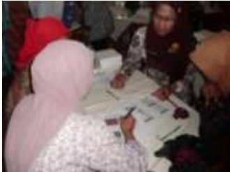
Figure 2. Designing mathematics learning process by using PMRI model with local genius as a context

At the next step teachers discussed how to design local genius as a context on PMRI, then designing teaching materials and student activity sheets based PMRI, designing devices the elementary mathematics learning using PMRI models, and the sample of mathematics learning process by using PMRI model.