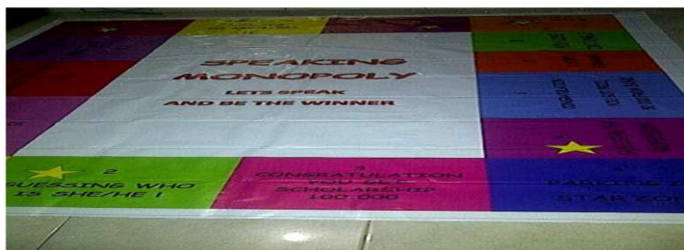
Picture 1 Preliminary form of the product

As seen on Picture 1, the preliminary form of Communicative Boardgame is a modification of conventional monopoly game. In the conventional monopoly's board, there are forty spaces with the name of countries in each block, while Communicative Board games is divided into 15 zones or spaces. In Modifying English Monopoly Speaking Game or Communicative Board Game , the writer needed to construct the materials and tasks, they are related to speaking activities. There is a large and big board ( 2 meters x 2,5 meters), one big dice, big pawn, money, cards are the tools to play the game. The Zones in this Monopoly Game are: