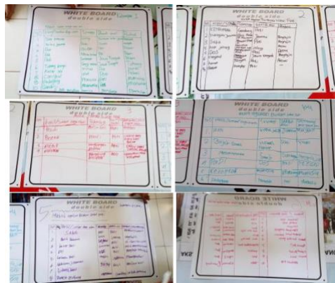
Figure.3 Memory Matrix Results

matrix. The results of the charging task could be seen in the following figure.