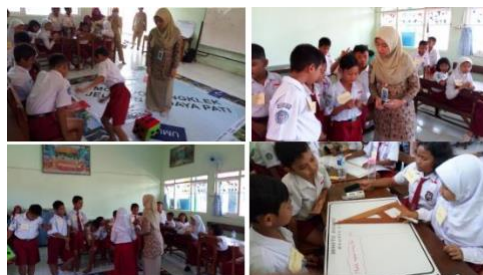
Figure 2. Implementation of Thematic Learning Using Monek Billking Pati Culture Wisdom

The next learning activity was playing Monek Billking as Wisdom of Pati Culture. The implementation of the game was carried out under different conditions, ie the teacher directed the students of SD Widorokandang 01 to play Monek Billking as Wisdom of Pati Culture in the school field, while the students of SD Sukoharjo 01 played it in class. Although the learning locations were different, this id not change the students' enthusiasm when learning thematic learning using the Monek Billking as Wisdom of Pati Culture.