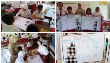
Figure 4. Result of Billboard Rangka Pati Culture Wisdom

The results of billboards rank showed students could understand the wrong concepts of the circumference and the area of space that was rectangular, rectangular, and triangular from one of the cultural wisdom of Pati that was religious tourism Tomb of Mbah Saridin.