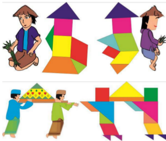
Figure 2. The design of Marionette Tangram

In the define phase, the appropriate teaching media was designed. Local wisdom related to the theme was the basis for making the media. Marionette Tangram was designed from Tangram puppets. Marionette is a puppet with wires that is controlled from above [16], while Tangram is a truncated puzzle which is divided into 7 geometrical shapes called tans [17]. Figure 2 below describes the design.