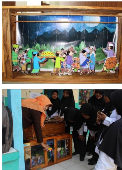
Figure 3. The dissemination of Marionette Tangram Media

Indonesia. Moreover, the media copyright has been registered with the copyright registration number 000123371.