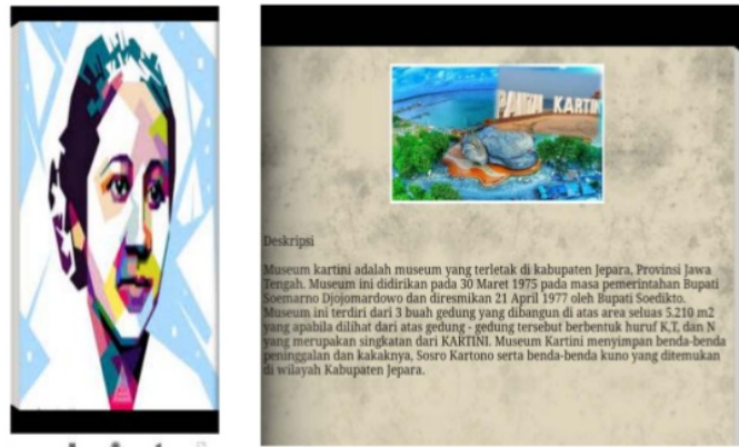
Figure 3. Application Display

Figure 3 is an electronic module of educational tourism in Jepara district, Indonesia with several tourist destination destinations, one of which is Kartini Beach. Looks like a book that can be turned the page (flip).