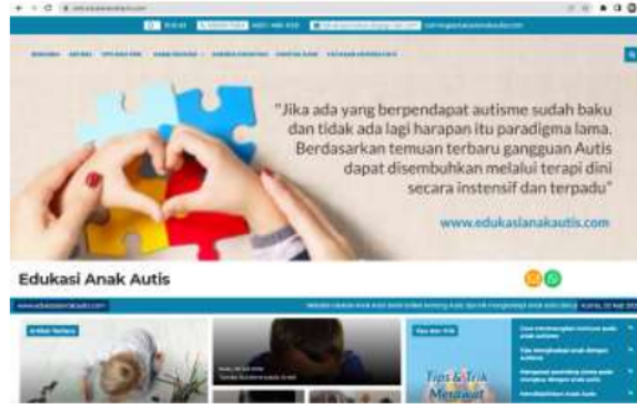
Figure 4. Display of the Website Home Page