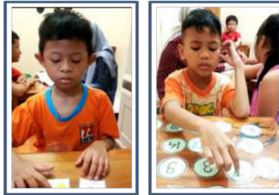
Figure 1. Activities Of Autistic Children Using Visual Media In Learning For Concentration Abilities

Visual media in the needs of autistic children are used to train sensory perception sub-skills and practice it repeatedly so that it can be mastered as reinforcement. According to explained that visual media can facilitate a practical understanding of memory in the parable of objects to provide a relationship between the content of learning material and the occurrence of learning resources for autistic children[20], [21]. The function of visual media is an effort to improve concentration abilities which can help vocabulary and language knowledge as individual therapy, as is the case with the results of interviews with the educators of the Lentera Hati School Foundation, Kudus Regency, which stated that there was an influence of stimulus learning media in the form of visuals as an aesthetic approach and a simulation method for increasing cognitive memory on the perceptual needs of autistic children.