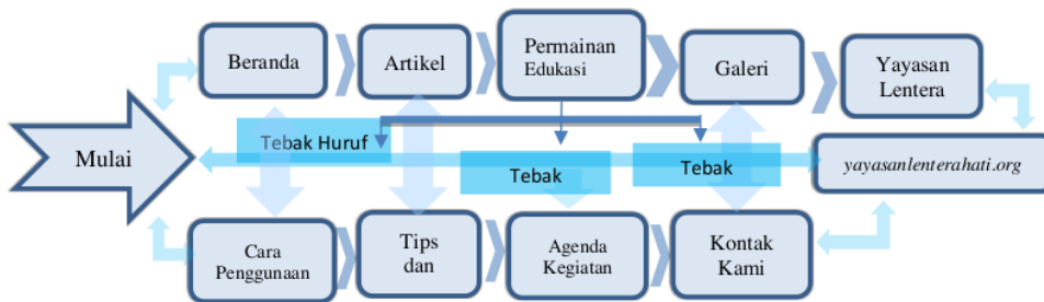
Figure 3. Website Structure Flowchart

The domain is a unique name to identify the name of a computer server, such as a web server or email server on the internet. The domain is also called the address that needs to be inputted to access a website. The web design is a Top Level Domain (TLD) with a .com extension, www.edukasianakautis.com . This domain name was chosen as one of the development objectives: to educate autistic children through the media website. The structure of the educationanakautis.com website can be seen in Figure 3 as a diagram below.