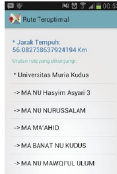
Figure 4. List of school to visit